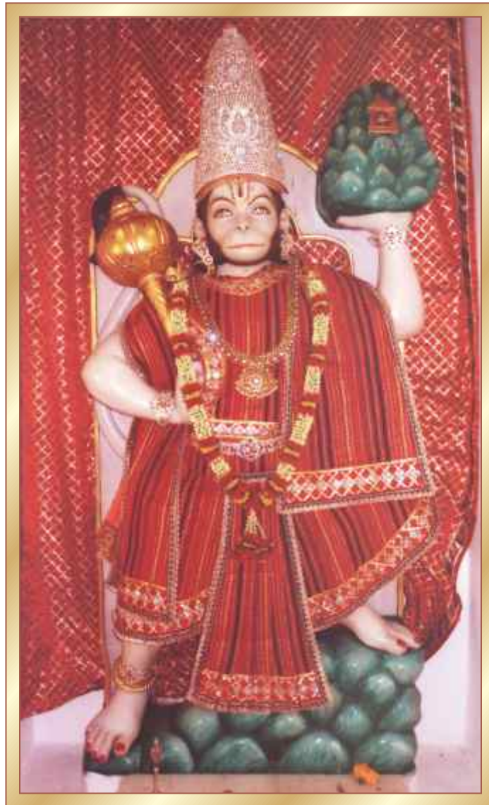
A glimpse of the Hanuman Mandir at Joonktolle Tea Estate, Assam