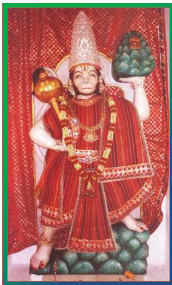
A glimpse of the Hanuman Mandir at Joonktollee Tea Estate, Assam